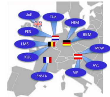
Fig. 2: BATWOMAN consortium.

CONSORTIUM: contains partners (6 universities, 1 research institutes and 4 companies) specialised in three specific application fields of acoustics: Automotive sector, room acoustics and musical instrument acoustics, see Fig. 2. The industrial partners bring in application knowledge and expertise, and the research partners bring in a range of engineering methodologies, the capability of PhD research training, provision of courses and dissemination of results.